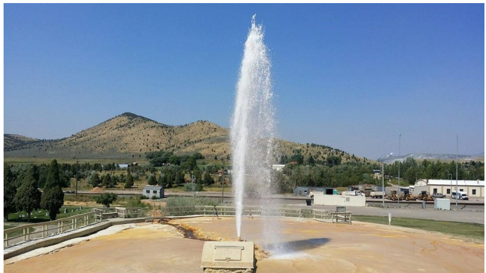
2 The "world's only captive geyser" is timed to erupt every day at noon in Soda Springs.